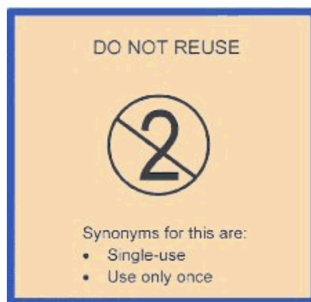
Figure 6-1 Do not reprocess symbol

Note: Single patient interrupted use in accordance with the manufacturers' instructions for use is not considered to breach this criterion.